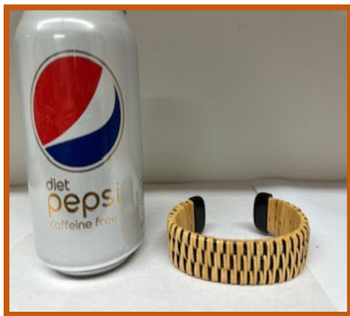
S1 Twill Bracelet Denise Bendelewski

Using a metal cuff and black cane staves Student will weave with natural weaver in a twill pattern to make this bracelet. Black end cap will be added. Small, Medium and Large metal cuff will be offered. IF student needs an x-small or x-large please contact teacher.