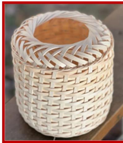
W8 Japanese Flower Basket Dani Sue Anderson

All Levels W 4" L 7" H 3" $35.00 Kit $30.00