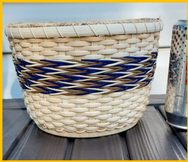
S4 Spiraling Arrows Bowl Pat Mercer

If you love weaving arrows and are looking for a challenge, this is the project for you. This unique spiral weaving pattern is achieved through a combination of triple twining, reverse triple twining and chase weaving. The body of the bowl is achieved through start/stop weaving F/O natural, reminiscent of Nantucket style without the form.