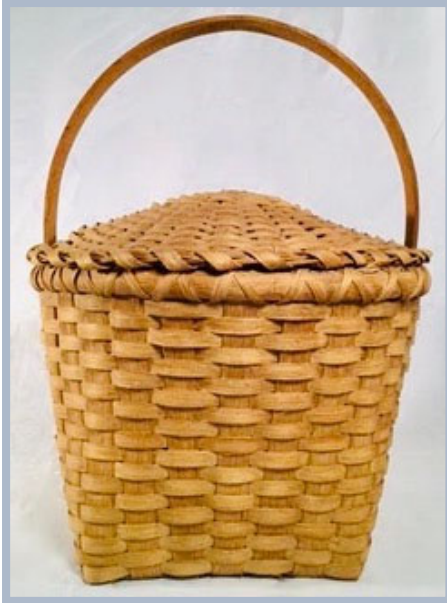
F6 Traditional Feather Basket Sandy Atkinson

An antique pattern developed somewhere in the 1800's for use around the farm. Basket was actually used to keep goose down feather from blowing in the wind while plucking the goose. A good beginners + or all around basket as it features a captured lid, a little tricky but not hard to master. Shaping and sizing for handle insertion is stressed in class.