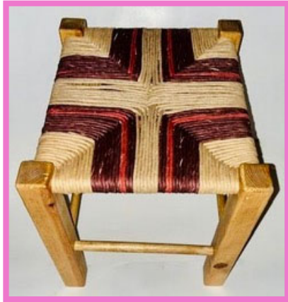
F3 Western Rush