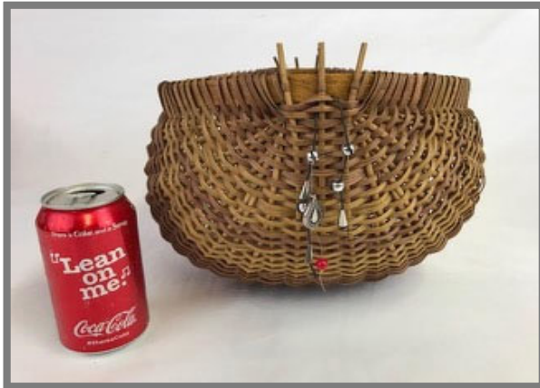
T5 Maumee Bay Potato Basket Sandy Atkinson

Different start on rib basket, drilled holes in 10" hoop allow ribs to attached to hoop, then continues into frame. Woven with round /flat reeds, dyed reed dark green/ dark brown accents side weaving. Shape stressed in class to obtain classic potato basket shape. Beaded dangles on one side done in class. Beads shape/sizes subject to availability.