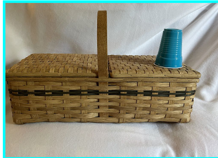
WT2 Mammy's Lidded Picnic Basket Linda Elschlager

Special Tools: A longer Weave Rite Tool, Needle Nose Pliers