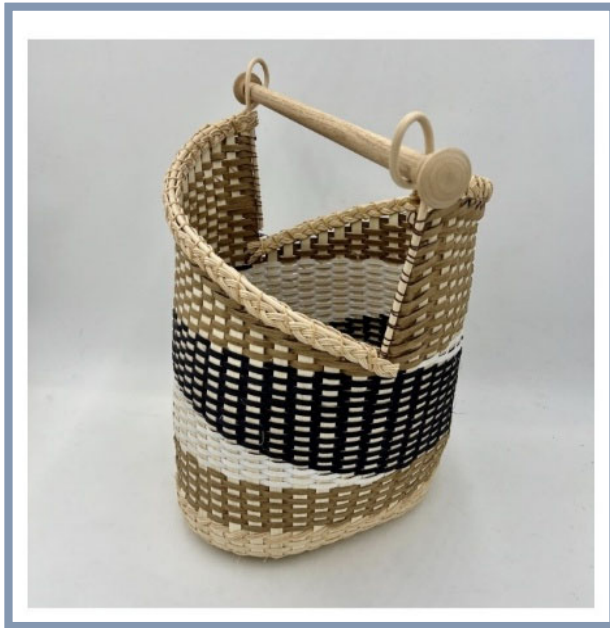
F12 Whirlwind Basket Dani Sue Anderson

The Super Unique Whirlwind Basket is crafted using distinctive materials such as paper splint, whitewashed reed, and braided round reed. Its weaving techniques create dynamic, winding patterns that twist elegantly around a sturdy wooden slotted base. Finished with a one-of-a-kind wooden handle, this basket offers ample room for storage as it measures 13" in diameter and 18" tall including the handle. Designed for intermediate to advanced weavers, this project is both challenging and highly rewarding. Plus, there are plenty of opportunities to personalize your basket with a variety of dyed reed.