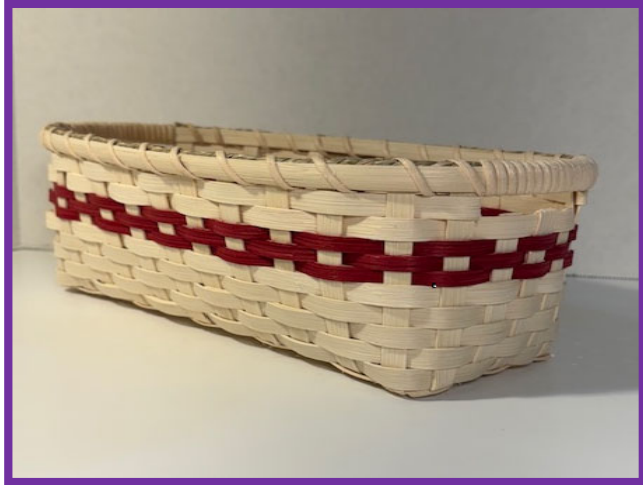
F1 Catch It!