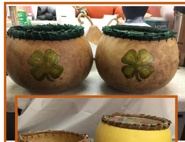
S3 Pine Needle Rim on Gourd Sheryl Scott

This is a 7" bowl, that students will get to weave a colored pine needle rim. 7" gourd, waxed linen thread, dyed pine needles.