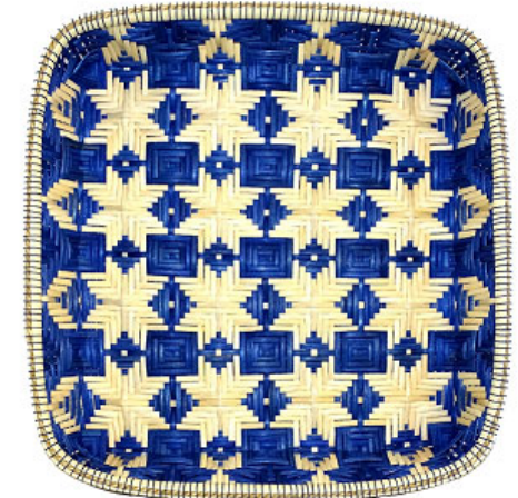
F13 Christmas In July Tray