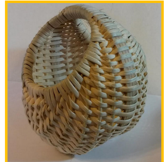
S6 Petite Hen Nancy Matthews

Petite Hen is a smaller version of the traditional hen basket. Frame is made of 3 wooden hoops. Ribs are added one at a time on each side. Short rows will be required to totally cover frame. Weavers are 11/64" natural flat oval.