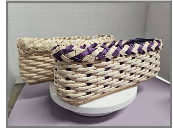
T7 Brewing Joy Lorelea Roberts

Special Tools: 2-3 Awls, Ice Picks or Wooden Skewers