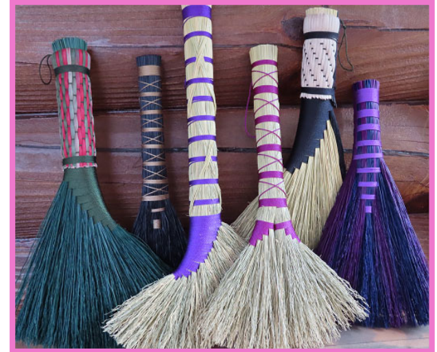
F5 Sweeping Beauty: The Art of Broom Making Bev Lawson

Discover the rich tradition of handcrafted brooms in this hands-on class. Using natural broomcorn and traditional techniques, you will learn how to construct a variety of functional and decorative brooms. Participants will explore binding methods, handle wrapping, and color accents to personalize their creations. Whether you're a beginner or an experienced maker, this class will provide the skills and knowledge to craft beautiful, durable brooms that honor the time-honored art of broom making.