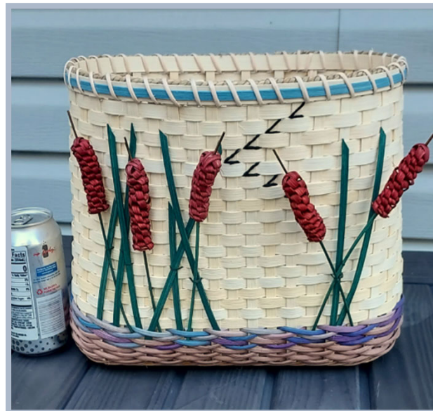
F8 Down By The Pond Pat Mercer

Intermediate W 9" L 15" H 7" $62.00 Kit $62.00