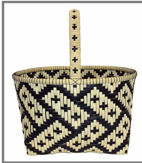
T9 Crossing Paths Laura Lee Zanger

The Crossing Paths is a 1-3-5 twill number rhythm where the brick-like blocks of crosses intersect uniquely. The handle is wrapped and woven with complimentary crosses too. You will learn how to measure and line up the designs so they will be centered at the top of the handle and symmetrical on both sides perfectly.