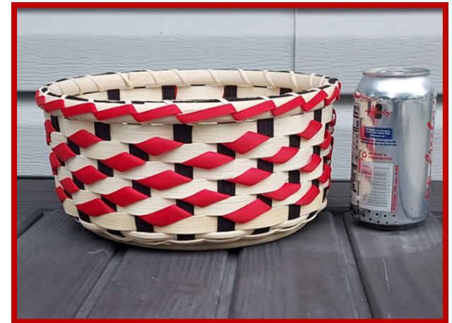
W6 Kaleidoscope Pat Mercer

All Levels D 5.5" H 3.5" $110.00 Kit $100.00