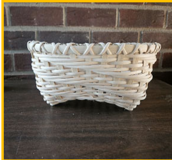
S5 Lying Cat Lorelea Roberts

Advanced D 11" H 5.25" $69.00 Kit $69.00