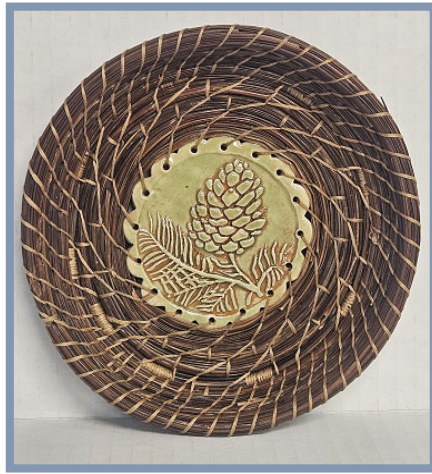
F9 Beginner Pineneedle Lorelea Roberts

Learn the art of pine needle basket weaving in this hands-on class! You'll create a beautiful, rustic basket featuring a customizable ceramic center and waxed linen thread in your choice of colors. Perfect for beginners and seasoned weavers alike, this class will guide you through the process of coiling and stitching pine needles to form a unique, nature-inspired basket. By the end, you'll have a stunning finished piece that combines natural materials with a personal artistic touch.