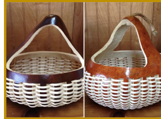
F2 Martin Gourd Basket