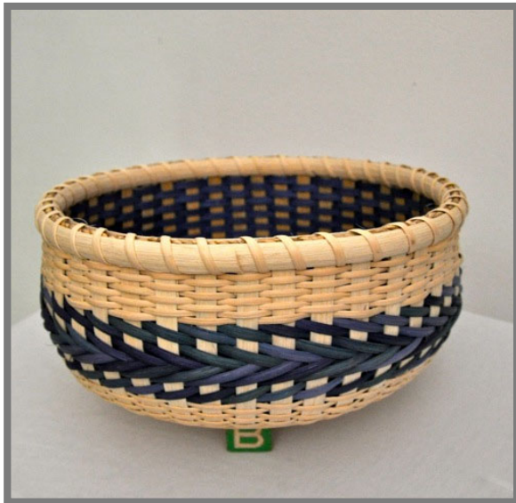
T8 Caribbean Reef Sandy Bulgrin

This sturdy double wall basket starts with a wood base. The inside basket is woven with smoked spokes and beautiful dyed reed. The outer basket is woven with natural spokes, and weavers, learn the French rand arrow with spaced dyed reed with shades of blue to accent the outside.