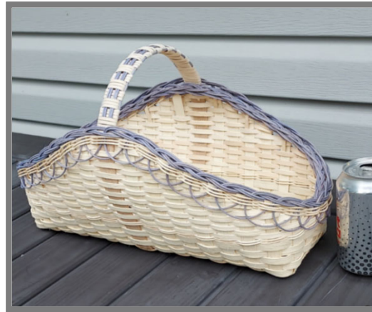
T6 Old World Charm Pat Mercer

Intermediate D 10" H 7" $68.00 Kit $68.00