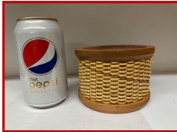
W5 4" Nantucket Box Denise Bendelewski

Using a white acrylic mold with cherry hardwood staves and a cherry base . Student will weave with natural cane and over two under two pattern. Some sanding of stave may be needed. A solid cherry rim will be added to finish the basket.