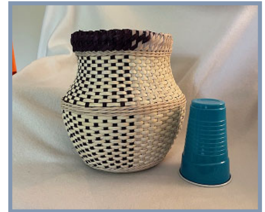
F11 Dusk and Dawn Linda Elschlager

This basket starts on a slotted base, highlights will be shaping, 4 rod wale in a over 2, behind 2, continuous weave and a double match stick rim. Some choice of colors will be available. (Plum, black and navy)