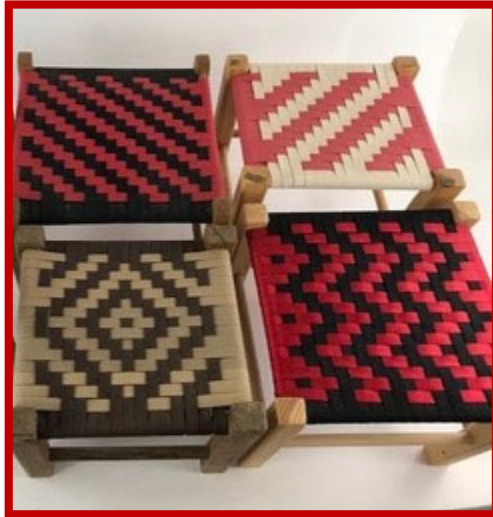
W4 Weaver's Choice Steve Atkinson

Students gets the choice of a selection brought to class they would like to weave. Four choices to choose from, the easiest is 3 X 3 Twill or 2 X 2, then more difficult Diamond pattern, or the 4 Rag Twill, using Shaker Tape or nylon webbing. Sizes of foot stool vary from 13" square to 15" square. Many choices of colors for the weavers will be brought to class. NOT TO BE USED AS A STEPPING STOOL.