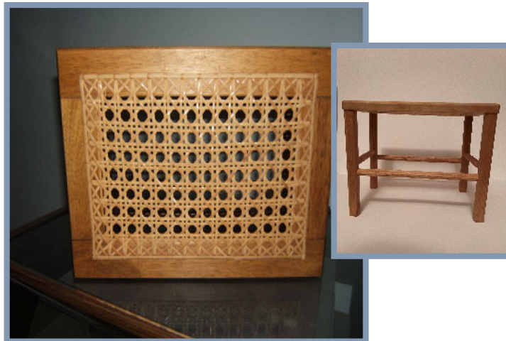
F10 Caned Stool Sandy Bulgrin

Students will learn how to cane a foot stool, it will make a wonderful addition to your home. You will learn the 7-step caning pattern on a beautiful handcrafted stool. The frame is finished in a light stain. In this class you will learn the techniques to cane your own chairs. 12 caning pegs included.