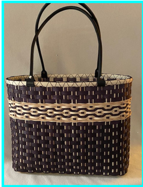
WT1 Rambler Tote Jamie VanOekel

Take the opportunity to weave a great tote to take on the road! Add overlays to stakes in a slotted base. Use 3 rod wale and reverse 3 rod wale along with more over lays to create a distinctive decorative band. Leather handles make it comfy to carry and waxed linen holds it all together.