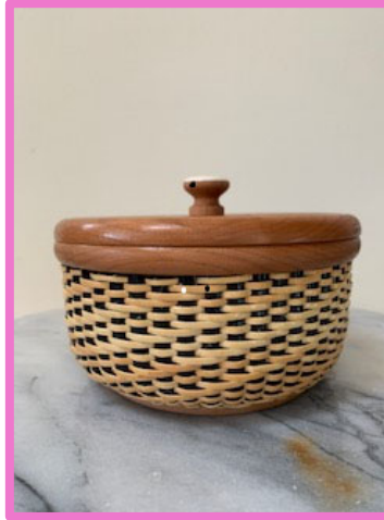
F4 Black & White Twill Denise Bendelewski

Special tools: Rubber Gloves, 4-3" Long Clamps, Heavy Duty Packing Tool